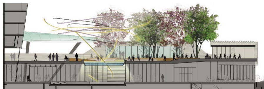
Top: View of Plaza at night Above: Landscape masterplan Left: Sectional elevation through Plaza

Site Area: 0.6 Hectares Client: Beetham Organisation Architects: Ian Simpson Architects Engineers: WSP Cantor Seinuk Overall Project Value: £600 million