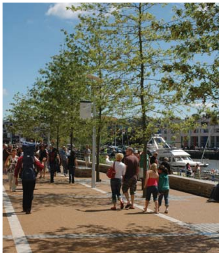
Top: Cathedral Walk; Amalanchier lamarckii with Green Wall frontage behind Above: Elevated walkway, floating reed beds and boardwalk Left: View of the SS Great Britain from the boardwalk; Harbourside Walk