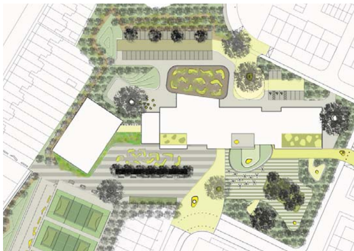
Top: Concept diagram Above: Axonometric sketch Left: Illustrative plan

Client: Department for Education & Skills Architects: Penoyre & Prasad Engineers: Atelier Ten Alan Conisbee & Associates