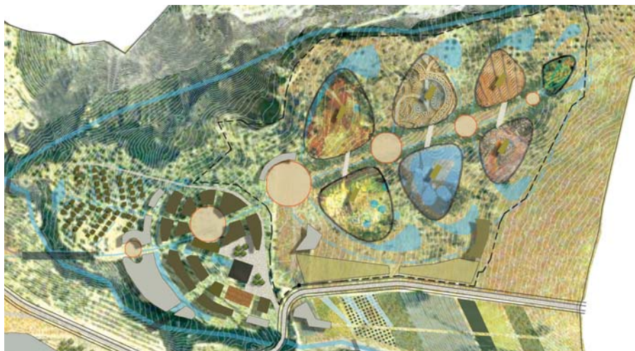
Above: Masterplan; Pedestrian/cycle network; Water management; Ecology Left: Jardin del Agua

Site Area: 250 Hectares Client: Urbespacios Architects: Richard Rogers Partnership SL Engineers: Arup