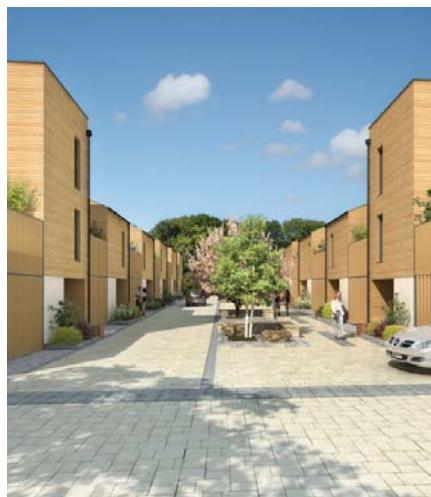
Top: Clarks Street and the Shoe Tree Above: Landscape masterplan; Combined strategy: Walks & paths; Habitat; Gardens; Trees Left: Axonometric view of typical spine road; View of mews