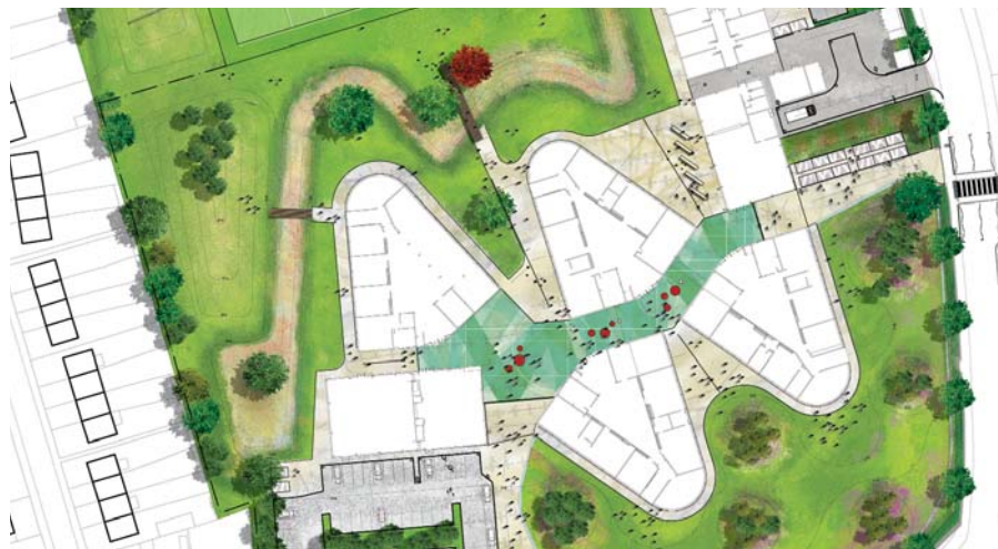
Top: The Ha-ha with view of the Academy Above: The Agora Left: Extract of Landscape masterplan

Site Area: 5 Hectares Client: Department for Education & Skills Architects: Wilkinson Eyre Architects Broadway Malayan Engineers: Arup Buro Happold Quantity Surveyors: Davis Langdon Overall Project Value: £21 million